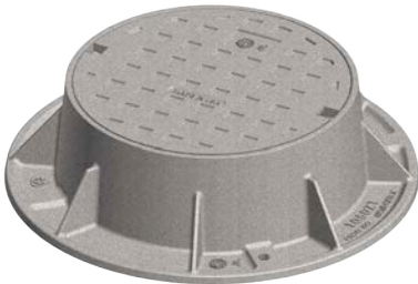
Type A solid cover illustrated